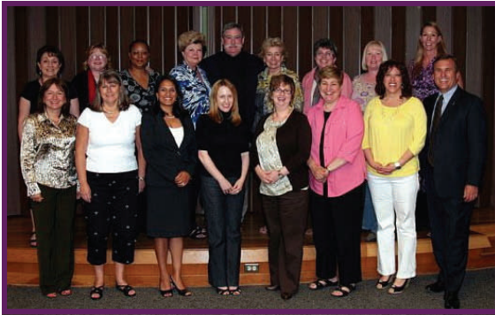
FJC Directors met to discuss programming in a special session at the Bexar County FJC.

The 2010 International Family Justice Center Conference was an outstanding success. The conference, held April 27-29, 2010 at the Crowne Plaza Hotel Riverwalk brought over 400 domestic violence professionals from around the country to learn more about promising practices and emerging issues in the evolving Family Justice Center movement.