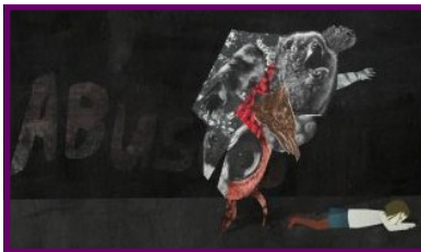
Image above taken from the Verizon Foundation’s Monsters video.