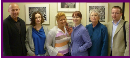
Polish visitors, sponsored by the U.S. State Department, visit the FJC. Middle East visitors are not pictured in order to protect their safety for the controversial work they are doing for women in their countries.

Because domestic violence affects the lives of millions of women and children worldwide in all socio-economic and educational classes, the FJC hosted leaders from Algeria, Bahrain, Egypt, Jordan, Oman, Palestinian Territories, Saudi Arabia, United Arab Emirates and Poland who visited the Family